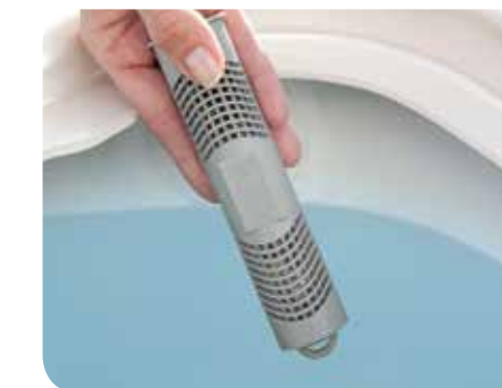
FreshWater Ag+ silver ion cartridge

Additional FreshWater bottled products are also available and designed specifically for your Hot Spring spa.