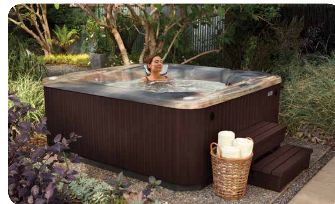
Bolt spa shown with Tuscan Sun shell / Espresso cabinet