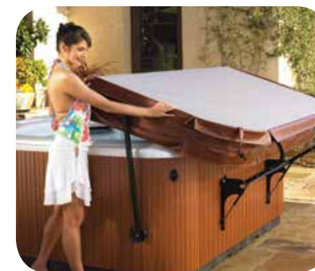
CoverCradle® cover lifter

These top-of-the-line cover removal systems feature a low-profile design and ultra-smooth gliding mechanism. The CoverCradle uses dual pneumatic gas springs to make cover removal a breeze, while the CoverCradle II uses a single pneumatic gas spring. Both require 24" clearance.