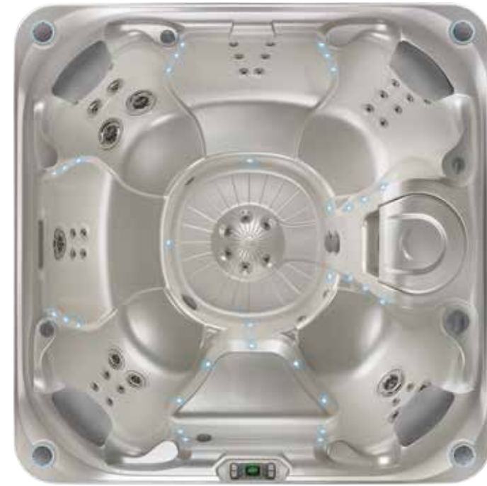
Pulse shown with Pearl shell

Ready to become a Hot Tubber? Scan to read reviews from Pulse owners.