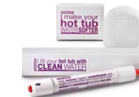
Clean Screen pre-filter and Vanishing Act calcium remover

Spa water is easier to maintain when you remove impurities using the Clean Screen® pre-filter and Vanishing Act® calcium remover. These one-of-a-kind solutions extend the life of the water and protect your components.