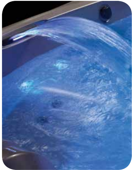
Vidro water feature

The Vidro® water feature's illuminated arc of water adds beauty and ambiance to your spa experience.