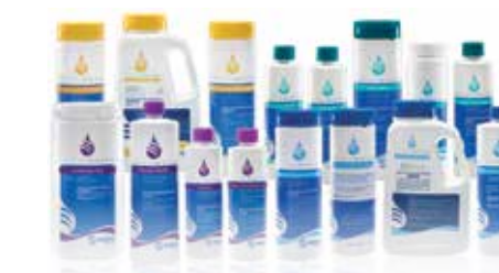
FreshWater product collection