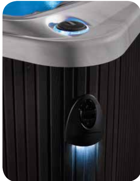
Exterior sconce lighting

Create an entertaining atmosphere anytime with exterior lighting on the Limelight® Collection Gleam™. Sleek sconces illuminate all four corners of the spa with multi-color LED lighting. The exterior lights can be set to automatically turn on for four hours each evening.