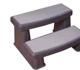
Polymer step in Espresso finish

The durable, lightweight polymer step provides a stable entry point into your hot tub and is recyclable at the end of its life.