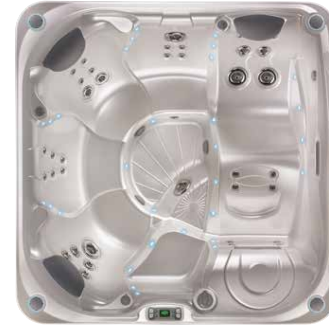
Flair shown with Pearl shell