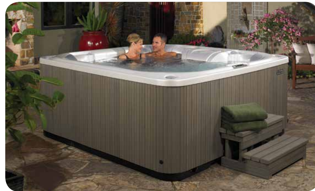
Pulse spa shown with Pearl shell / Coastal Gray cabinet

"Great to go in after dark to sit in the hot water and watch the stars. Many times my knees hurt and it feels so good to have that hot water around them. My wife has trouble with her lower back and goes in the hot tub to loosen the muscles up. The grandkids love to get in and play."