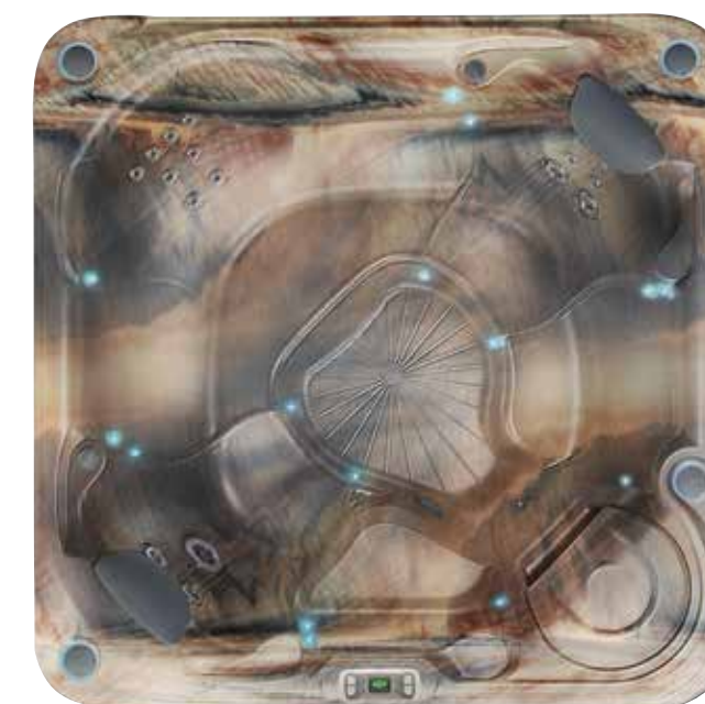
Bolt shown with Tuscan Sun shell

"I have owned other spas, this one is simply fantastic... easily maintained, very comfortable and efficient. Perfect & ideal for my needs." - Bolt Owner, Nevada