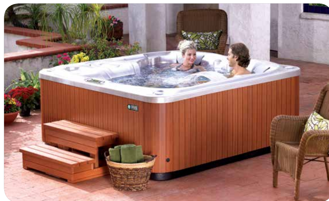
Glow spa shown with Champagne Opal shell / Redwood cabinet

Ready to become a Hot Tubber? Scan to read reviews from Bolt owners.