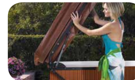
UpRite® cover lifter

Ideal for limited clearance applications including decks and gazebos, the UpRite cover lifter provides an added element of privacy when the hot tub is in use. Requires only 7" clearance.