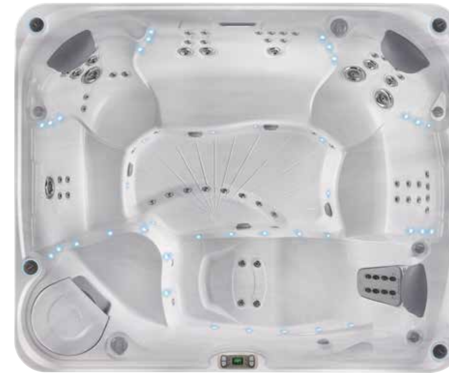
Gleam shown with Sterling Marble shell

Virtually every day we start or end with our Gleam hot tub. Whether it's morning coffee & tea or an evening warm up, it's always the same... "awesome" – Gleam™ Owner, Ohio