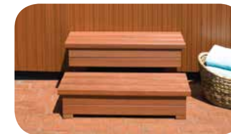
Everwood step in Redwood finish

Exclusive steps beautifully complement your Limelight® Collection spa and allow for safe entry and exit.