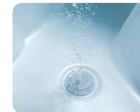
FreshWater III high-output ozone