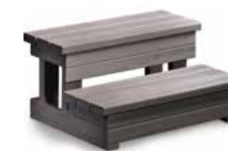
Everwood step in Coastal Gray finish

Made from the same rigid polymers as your Limelight Collection spa cabinet, a matching Everwood step requires very little maintenance.