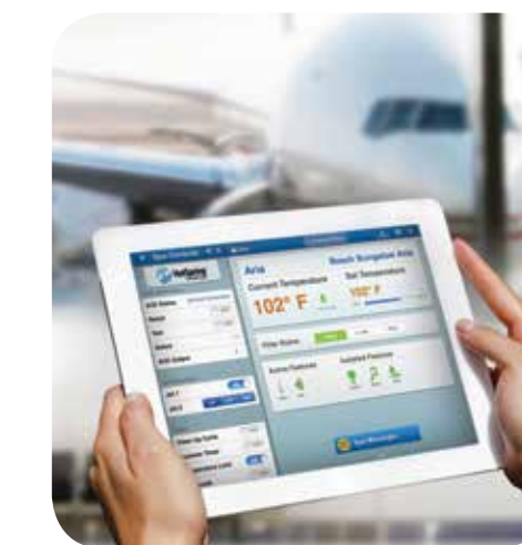
Connexion app as shown on an iPad®

Visit www.hotspring.com/connexion to learn more.