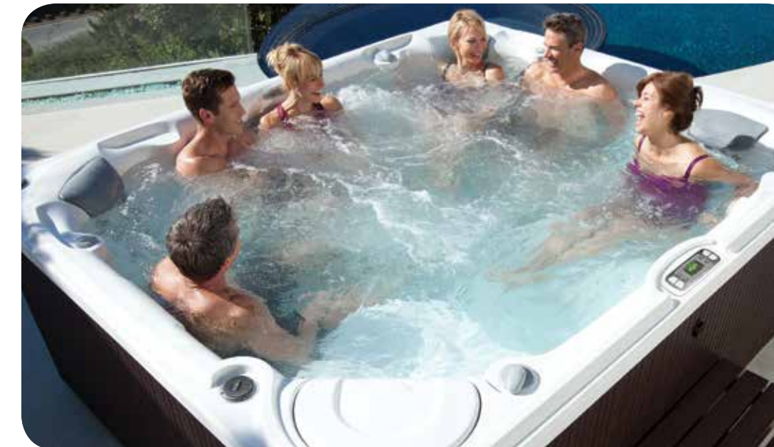
Gleam spa shown with Sterling Marble shell / Espresso cabinet