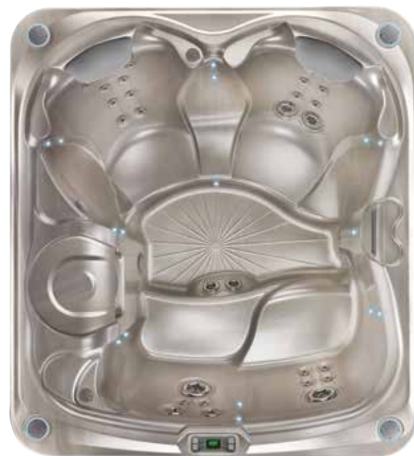
Glow shown with Champagne Opal shell

Ready to become a Hot Tubber? Scan to read reviews from Glow owners.