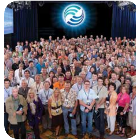
Hot Spring dealers regularly come together for training

Our experienced and reliable Hot Spring retailers make it easy for you to enjoy your Hot Spring spa. Knowledgeable, friendly and professionally-trained sales consultants will help you select the perfect hot tub model to fit your lifestyle. And, installing a Hot Spring spa is easier than you might expect. Your retailer will be happy to walk you through the simple steps involved in site preparation, and answer any other questions you have along the way. When you choose a Hot Spring spa, you'll enjoy unparalleled service and support before, during, and long after the sale. Hot Spring retailers, sales consultants, and service experts are all important parts of The Absolute Best Hot Tub Ownership Experience®. And, with more than 600 locations in North America, a professional Hot Spring retailer is rarely far away.