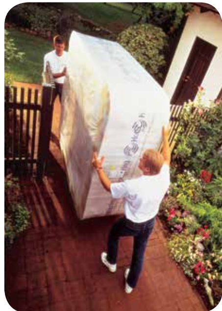
Typical hot tub delivery

As a Hot Spring® spa owner you become connected to a community of hot tubbers that spans the globe. But perhaps the most important connection is the one you'll have with your professional Hot Spring retailer.