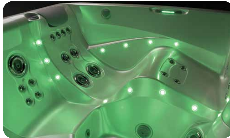
Raio lighting features multiple points of light