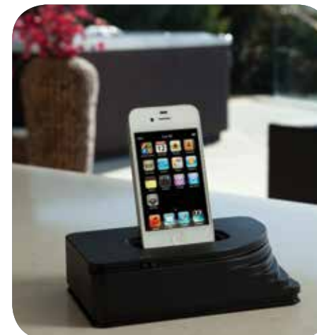
iPod® dock for in-home wireless sound system