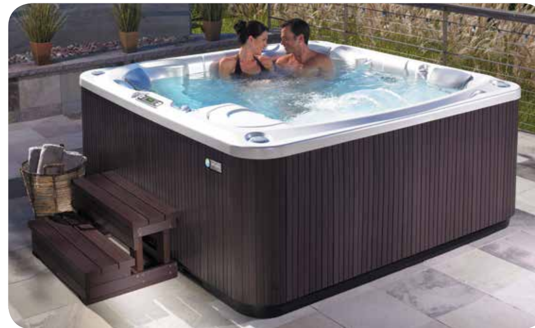
Flair spa shown with Pearl shell / Espresso cabinet