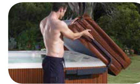
Lift'n Glide® cover lifter

Using the Lift'n Glide cover lifter is as simple as it sounds – lift the cover, glide it back and then open for quick, convenient access to your Hot Spring spa. Requires 14" clearance.