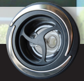
HALO JET DESIGN

This medium-size spa provides spacious seating for fun with family and friends. The open seating layout is great for visiting and relaxation. Choose from a variety of shell and cabinet colors to complement your home's environment.