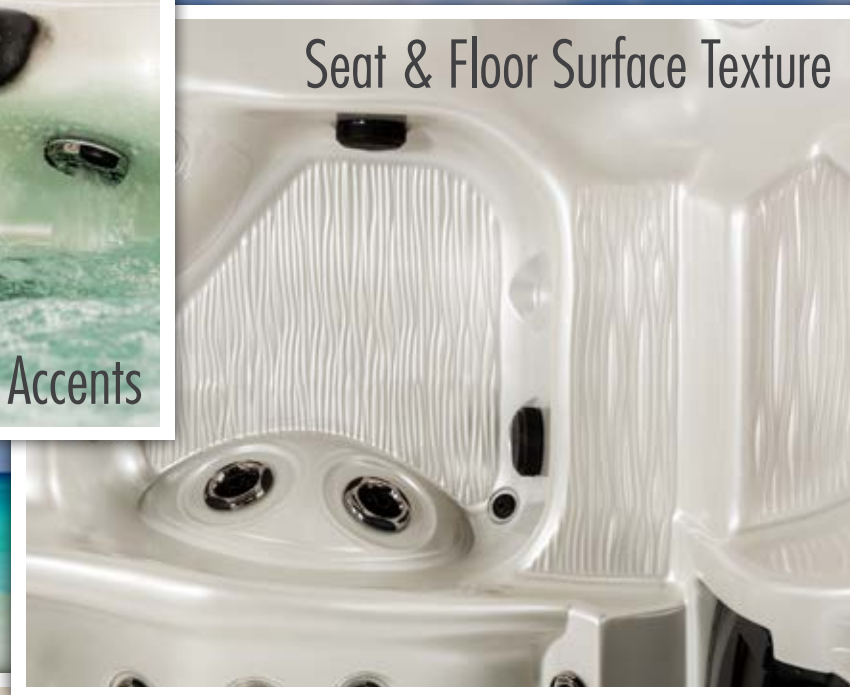
Seat & Floor Surface Texture